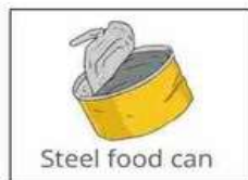
Steel food can